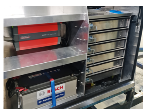
Full turn-key solutions from design to construct