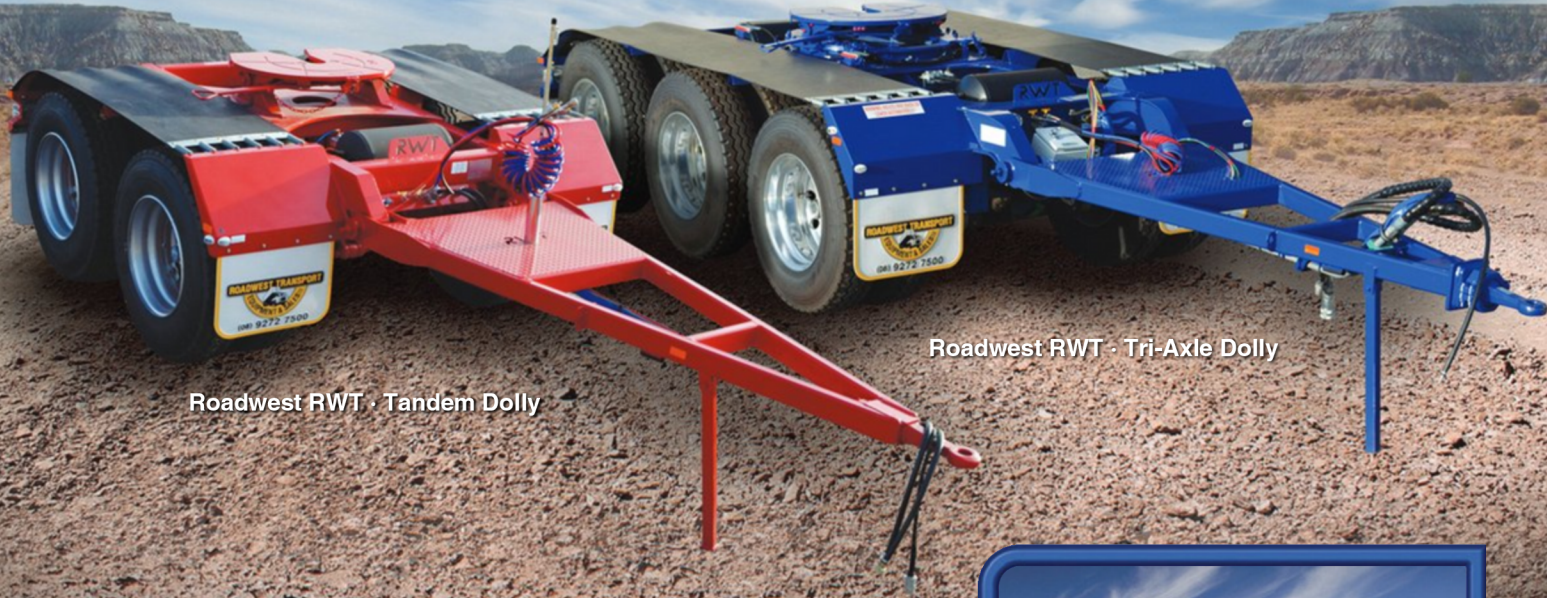
Roadwest RWT · Tandem Dolly