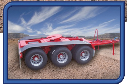
Roadwest RWT · Heavy Duty Tri-Axle Dolly

Disclaimer – Pictures shown include some non standard features and accessories.